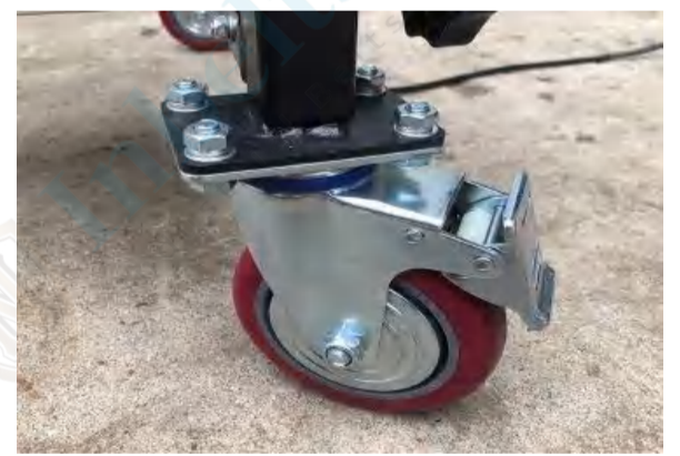
Mobile on 5" lockable swivel castors.