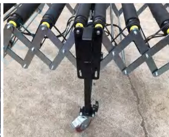
The legs and side links are connect by bolts.