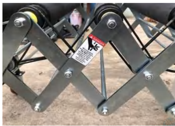
5mm thick strengthened telescopic side links