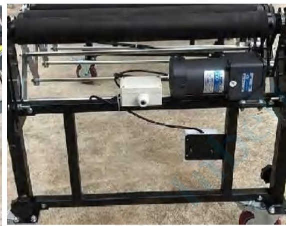
Each pair of legs are reinforced by cross bar.