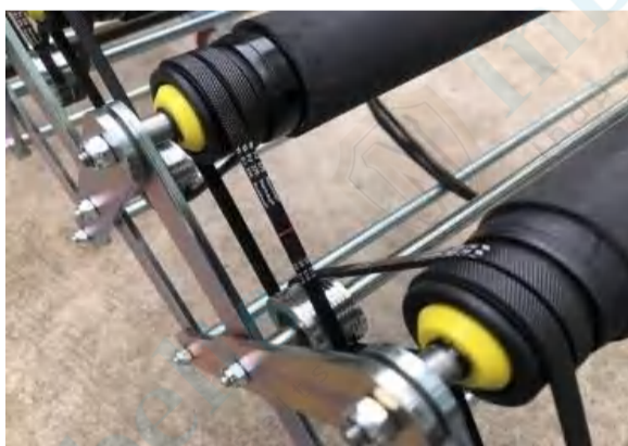
The rollers are driven by V belt