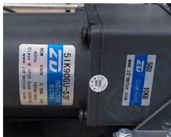
With one motor per meter to provide power