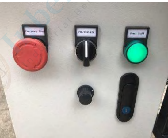
Control Panel for Conveyor Operation